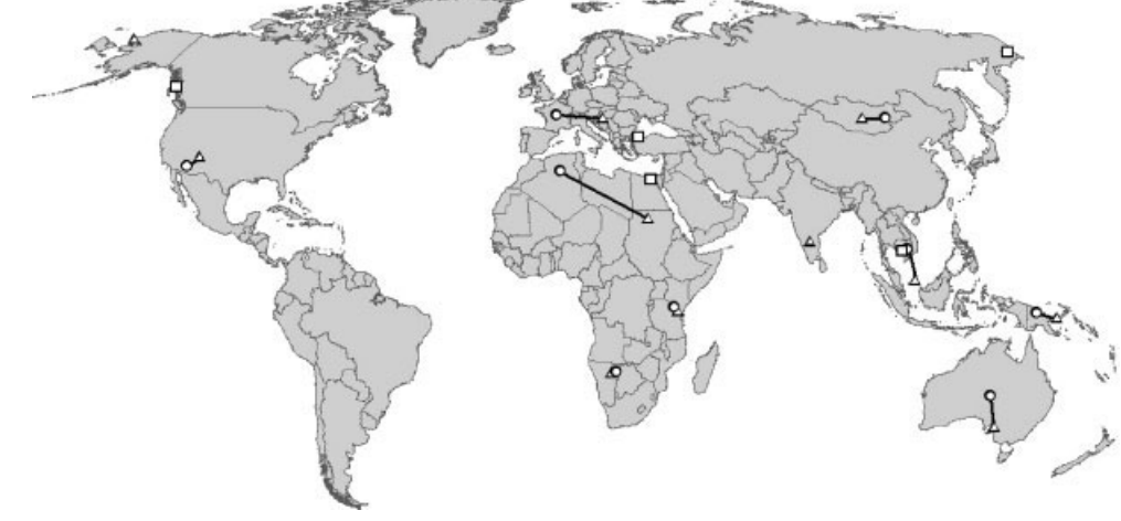
Fig. 1. Map of the world showing the approximate locations of populations used in the morphological analysis (triangles), populations used in the molecular analysis (circles), and waypoints (squares). Lines link the morphological populations and their genetic representatives.

eral recent studies (Harvati, 2001, 2003; Terhune et al., 2007) have used the morphology of the temporal bone to test hypothesized taxonomic divisions among fossil taxa.